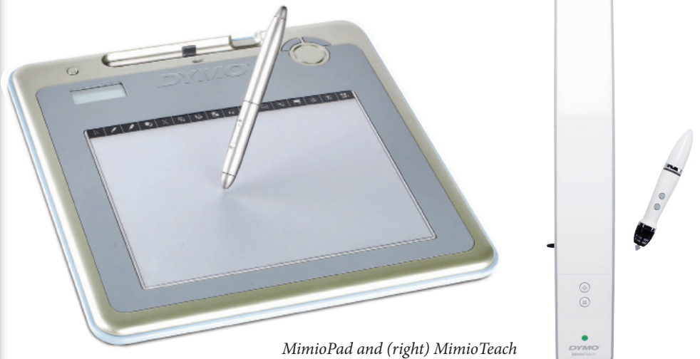
MimioPad and (right) MimioTeach